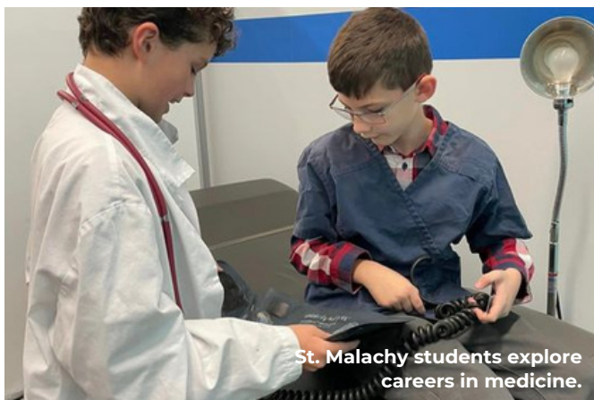
St. Malachy students explore careers in medicine.

In collaboration with JA BizTown®, thirteen schools within the Diocese of Des Moines annually empower students to explore diverse career pathways, refine financial skills, fulfill civic duties, and foster collaboration with classmates.