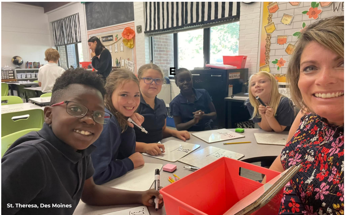
St. Theresa, Des Moines

Growing Disciples is a quarterly publication of the Diocese of Des Moines Catholic Schools Office. Content may not be reproduced without the expressed written consent from the Diocese of Des Moines. To submit a story idea, email grow@dmdiocese.org .