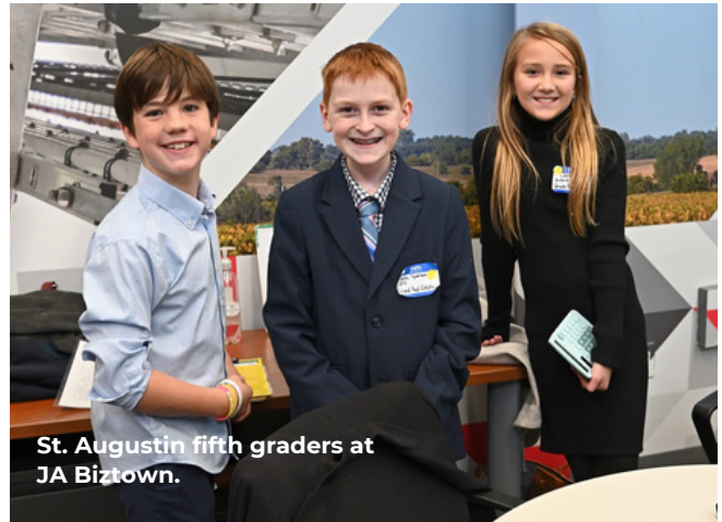
St. Augustin fifth graders at JA BizTown.

The curriculum is woven into classroom teaching, ensuring that the experience aligns seamlessly with educational objectives and offers a smooth transition from theoretical learning to the dynamic, simulated business environment.